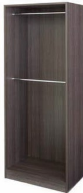
Hanging Rail Unit

H: 2000mm (walk-in) 1750mm (built-in) W: 500 or 700mm D: 450mm