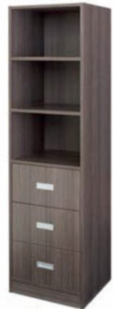
3 Drawer Shelf Unit

H: 2000mm (walk-in) 1750mm (built-in) W: 500 or 600mm D: 450mm