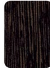
Straight Grain Wenge