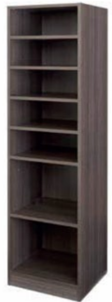
Open Shelf / Shoe Rack

H: 2000mm (walk-in) 1750mm (built-in) W: 500 or 700mm D: 450mm