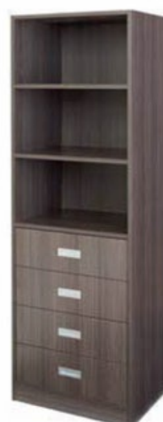
4 Drawer Shelf Unit

H: 2000mm (walk-in) 1750mm (built-in) W: 500 or 600mm D: 450mm