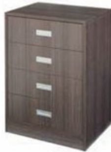
Base 4 Drawer Unit