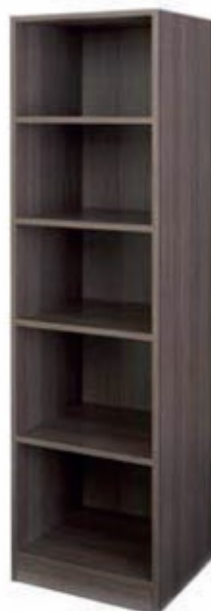
Open Shelf Unit

H: 2000mm (walk-in) 1750mm (built-in) W: 800 x 800mm D: 450mm